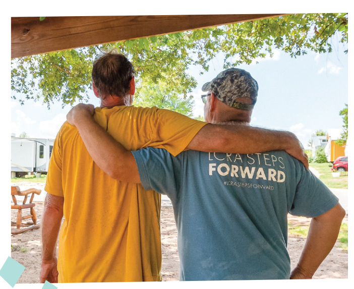
Mobile Loaves and Fishes

We participate in Amplify Austin Day, because we believe that housing alone will never solve homelessness, but community will. When our community comes together to achieve our mission of mitigating homelessness, there is a huge impact on our formerly homeless neighbors. Amplify Austin has helped Mobile Loaves & Fishes connect with our community over the 24-hour period of giving. We enjoy knowing that everyone has the opportunity to be involved in this mission of providing food and clothing, cultivating community, and promoting dignity to our formerly homeless neighbors in need.