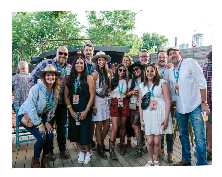
A group of VIP Attendees enjoying the beautiful spring weather from the VIP patio.