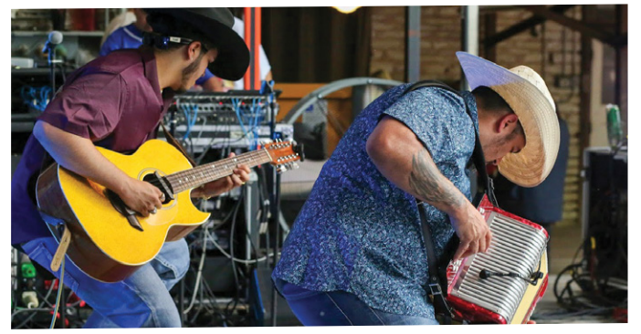
Rancho Alegre Conjunto Music Festival

Amplify saved the Rancho Alegre Conjunto Music Festival.