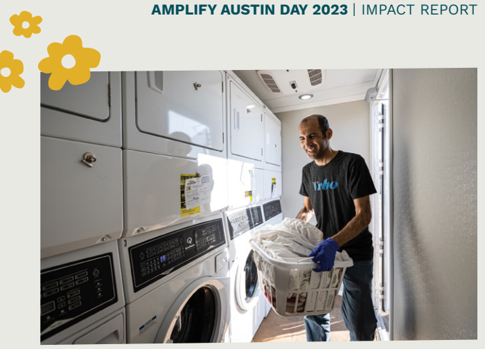
Volunteer at Mission Accomplished

Since its inception in 2016, the I Live Here I Give Here Amplify Fund (Amplify Fund) has given back nearly $12 million to nonprofits. It supports every participating nonprofit and is distributed proportionately across over 700 organizations. In addition to providing prizes and matching gifts, The Amplify Fund helps to reimburse nonprofits for their costs to fundraise on Amplify Austin Day, making this campaign a cost-effective way to fundraise.