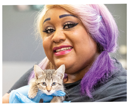
Volunteer at Austin Humane Society