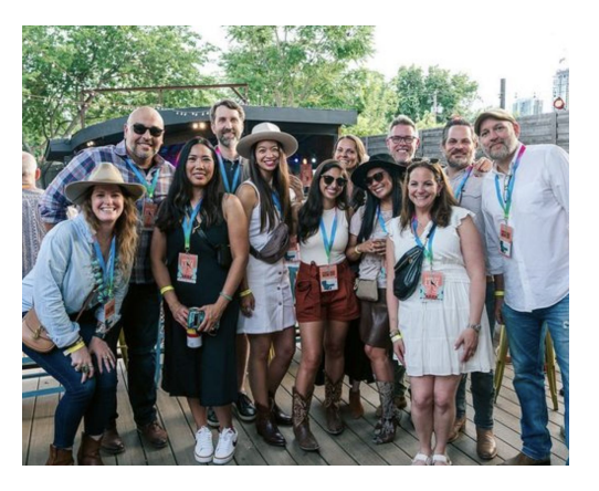
2023 Guests enjoying the VIP area