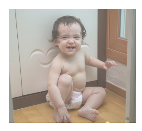
AUSTIN DIAPER BANK

Funds raised on Amplify Austin Day will purchase 20 brand new canoes for youth recreational day trips.