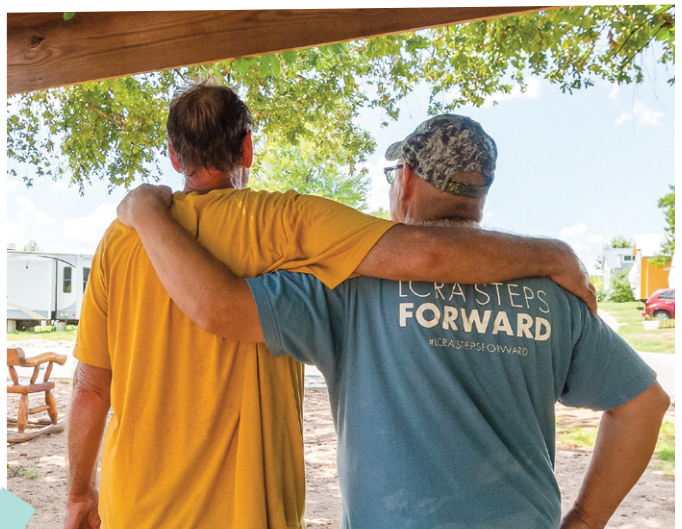
Mobile Loaves and Fishes

We participate in Amplify Austin Day, because we believe that housing alone will never solve homelessness, but community will. When our community comes together to achieve our mission of mitigating homelessness, there is a huge impact on our formerly homeless neighbors. Amplify Austin has helped Mobile Loaves & Fishes connect with our community over the 24-hour period of giving. We enjoy knowing that everyone has the opportunity to be involved in this mission of providing food and clothing, cultivating community, and promoting dignity to our formerly homeless neighbors in need.