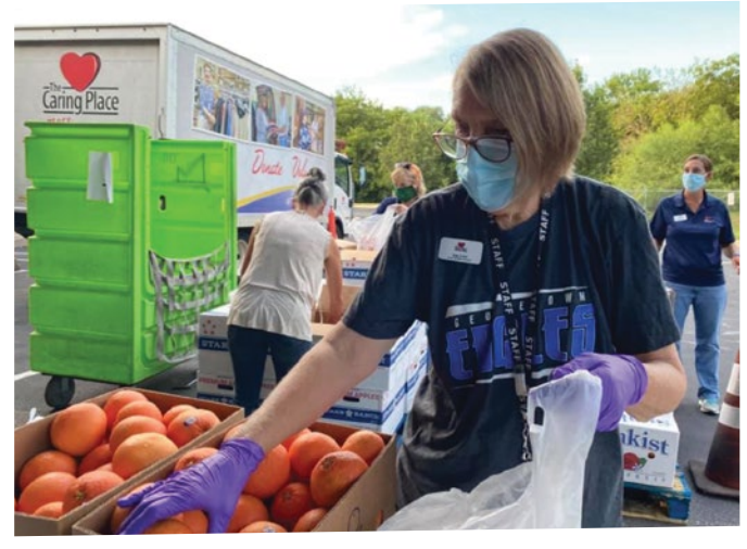
A volunteer at The Caring Place

Providing basic human needs to the city of Georgetown and surrounding areas is The Caring Place's specialty. They have a knack for bringing together their community for good. Through Amplify Austin Day, they raised enough funds to support over 1500 families fleeing domestic abuse by providing a safe place to spend the night.