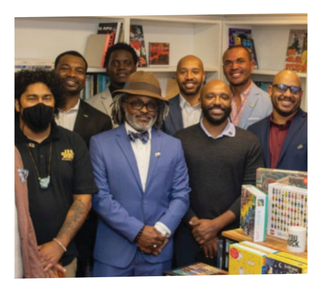
Participating Amplify Austin Day Nonprofit, 100 Black Men of Austin

We were proud to see the overwhelmingly positive response to this important work and are encouraged to expand our impact to the local BIPoC community.