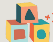
Youth & Children