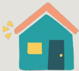
Housing, Shelter & Homelessness