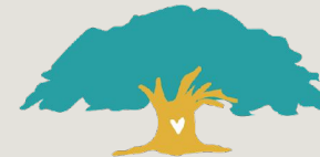
Environment, Conservation & Sustainability