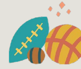
Sports & Recreation