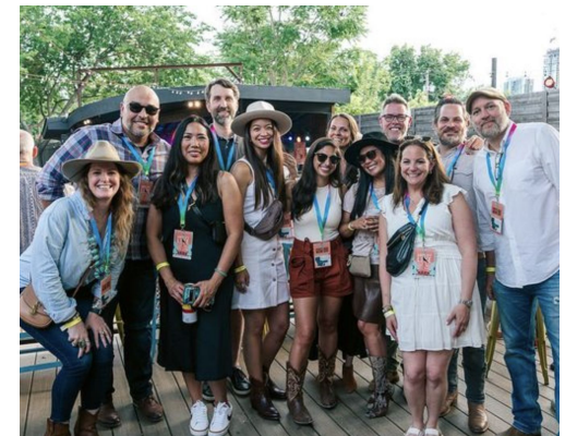
2023 Guests enjoying the VIP area