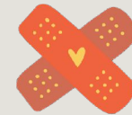
Health Care & Wellness